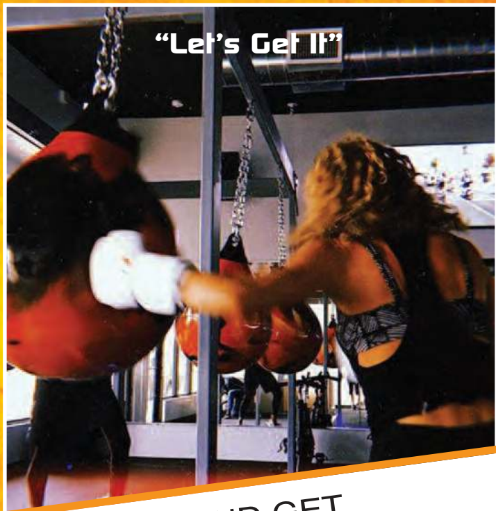
"Let's Get It"