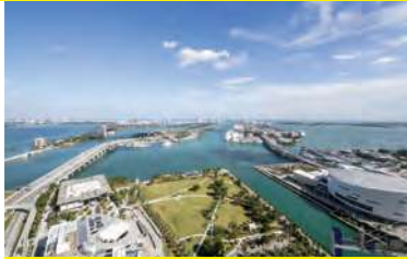
1040 Biscayne Blvd. #4202 $1,875,000

Parcview Villas - New construction 4BR/3BA, 2 story townhomes. Model A & B are corner units & contain 2,273 sf.