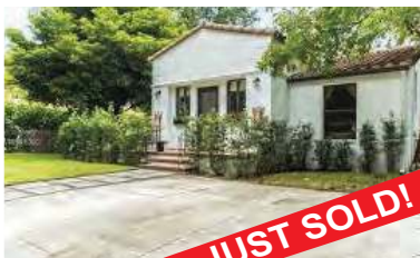
286 NE 99 St. $654,000

Exquisite & elegant 4BR/3.5 BA home with a spectacular floor plan located in desirable Sunset neighborhood. Lots of natural light.