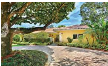
420 NE 95 St $1,199,000

In Miami's Upper East Side sits Casa Bianca, a new private gated community. Carina model: 3BR/3BA, 2,460 sq ft