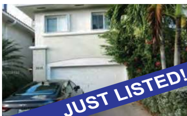
3015 NE Quayside Ln #8 $674,000

Modern 3,576 sf Beverly Hills pool ranch custom built on a 12,900 sf double lot, w/ 4 bedrooms, 2.5 bathrooms plus maids room and bath.