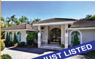
7201 SW 77 Ct. $865,000

Beautifully remodeled 4BR/3BA plus den and keeping all the pre-war charm! This gorgeous home has all impact windows and doors.