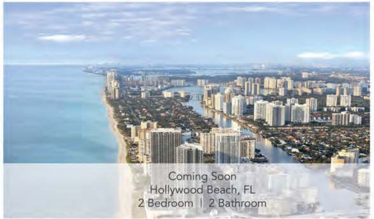
Coming Soon Hollywood Beach, FL 2 Bedroom | 2 Bathroom