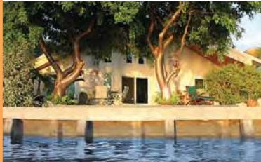
7810 Miami View Dr. $1,495,000

Exquisite 4BR/2BA home in highly desirable South Coral Gables. This 2,577 sq ft home features impact windows & doors.