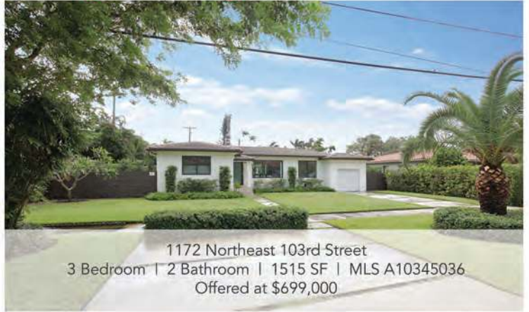
1172 Northeast 103rd Street 3 Bedroom | 2 Bathroom | 1515 SF | MLS A10345036 Offered at $699,000