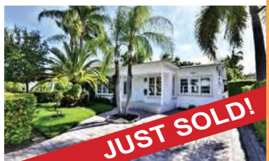
9180 Byron Ave. $752,180

GORGEOUS POND & FOUNTAIN VIEWS from this spacious 2 story townhouse with a 2 car garage.