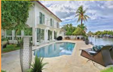
1810 NE 118 Rd. $1,880,000

This magnificent modern 5BR/4BA masterpiece was totally gutted & remodeled. This 11,803 sf lot, is 73' on a deep wide canal, w/ no fixed bridges.