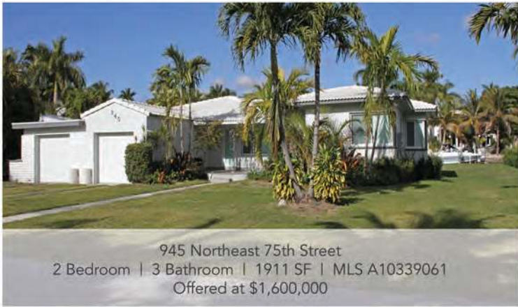
945 Northeast 75th Street 2 Bedroom | 3 Bathroom | 1911 SF | MLS A10339061 Offered at $1,600,000