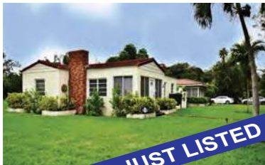
690 NE 118 St. $379,000

Located in the heart of Miami Shores, this lovely 4BR/ 3.5BA remodeled home features a new master suite, spacious family room.