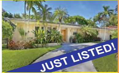
140 W Sunrise Blvd. $1,098,000

ALL DIRECT WIDE BAY/BEACHES VIEWS. Magnificent 3 story penthouse condo in the sky 3,932 sf under a/c with your own private pool.