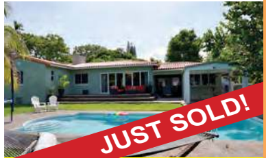
5201 NE 5 Ave $929,000

EXQUISITELY REMODELED 3BR/2BA home located in desirable Belle Meade, a private & gated community in Miami's Upper East Side.