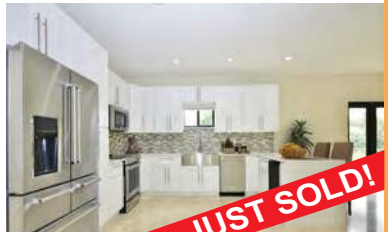
11004 NW 2 Ave. $625,000

Adorable pre-war charmer located on one of Biscayne Park's loveliest streets. This 2BR/1BA gem is on a large 8,625 sf corner lot.