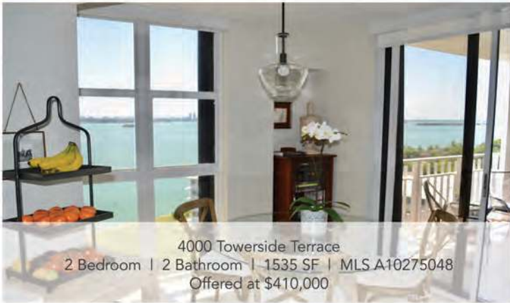
4000 Towerside Terrace 2 Bedroom | 2 Bathroom | 1535 SF | MLS A10275048 Offered at $410,000