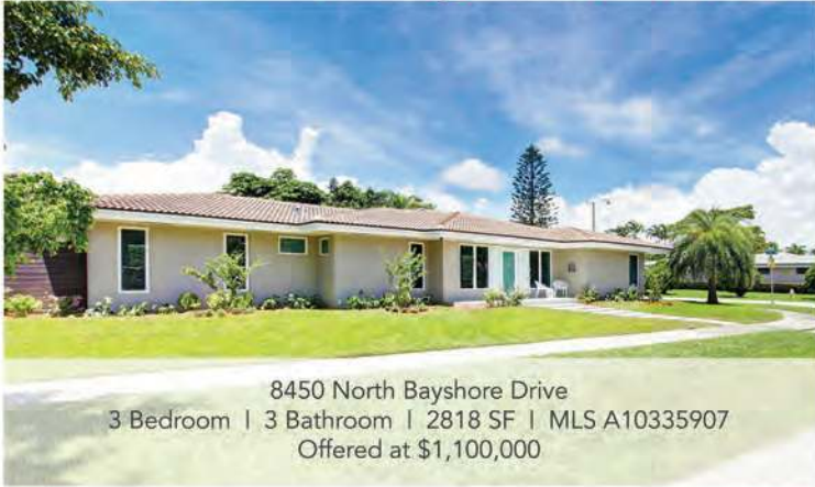
8450 North Bayshore Drive 3 Bedroom | 3 Bathroom | 2818 SF | MLS A10335907 Offered at $1,100,000

Counting our Blessings, Expressing our Gratitude, Giving Thanks