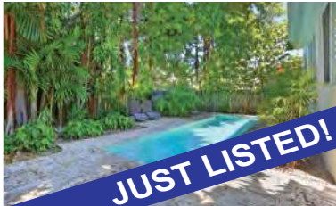
9016 Garland Ave. $835,000

Enjoy breathtaking direct wide bay views from this one of a kind custom built home built in 2012. Located on the exclusive gated North Bay Island.