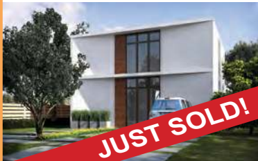
8611 Arboretum Ln. $800,000

Huge double lot! This gorgeous and remodeled pre-war Morningside home features 3BR/2BA & a guest cottage that is 1BR/1BA.