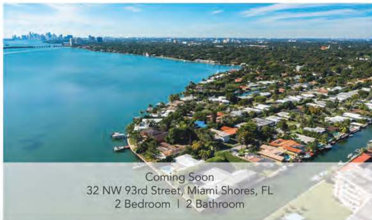
Coming Soon 32 NW 93rd Street, Miami Shores, FL 2 Bedroom | 2 Bathroom

All information provided herein is taken from the SE Florida Regional MLS & IMAP and deemed to be accurate but not guaranteed. This offering is subject to errors, omissions, prior sale or withdrawal without notice. It is not our intention to solicit to currently listed properties.