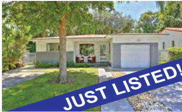
674 NE 75 St $699,000

EXQUISITE & TOTALLY REMODELED pool home in Surfside. This 1880 SF home has 3 large bedrooms & 2 bath & rich wood floors.