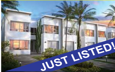
2451 NE 135 St. $639,000

This magnificent modern 5BR/4BA masterpiece was totally gutted & remodeled. This 11,803 sf lot, is 73' on a deep wide canal, w/ no fixed bridges.