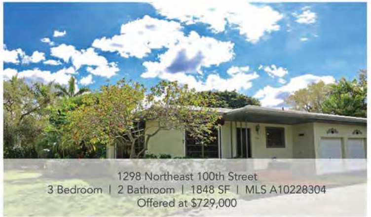
1298 Northeast 100th Street 3 Bedroom | 2 Bathroom | 1848 SF | MLS A10228304 Offered at $729,000