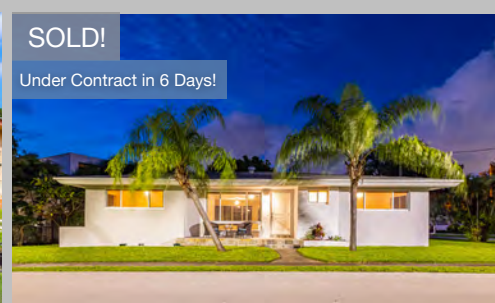
970 NE 87th Street | Shorecrest Sold @ $649,000