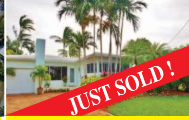
8943 Carlyle Ave $714,500

Located on prestigious Belle Meade Island off of Belle Meade, this 75 ft waterfront lot is 12,375 sf total, deep water, no bridges, 200 ft to bay.