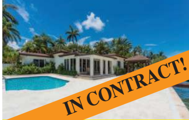
7623 Beach View Dr. $2,000,000

Palm Beach in Morningside! Gorgeous remodeled pre-war 2,327 sf home features 3 BR/ 2 BA and a guest cottage that is 1 BR/ 1 BA.