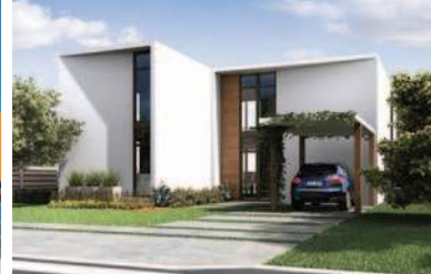
Casa Bianca -Milena $779,000

Be enamored w/ wide bay views from the moment you enter this superbly remodeled gated island 3 BR / 3.5 BA residence.