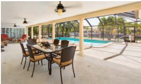
SOLD! Keystone Point $980,000

Best possible price. Shortest amount of time. Least inconvenience to you.