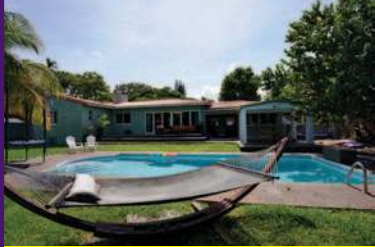
5201 NE 5 Ave. $1,149,000

Nobody Sells Miami Better !!! 305-742-5225