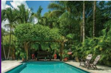
990 NE 72 Ter $749,000

3 BR / 3 BA, 2,460 sq ft living area , 10 ft ceilings, luxury finish on this modernistic all concrete-and-glass masterpiece. Pre-construction single family.