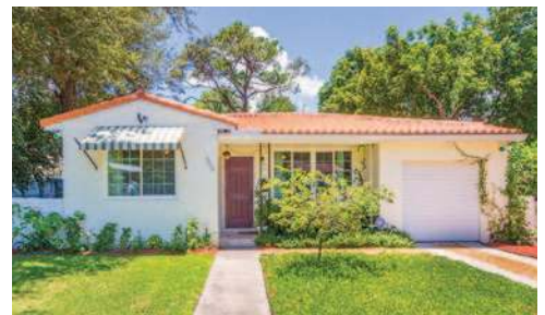
PENDING El Portal $399,000