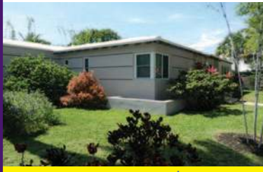
7400 NE 8 Ave $729,000

Exquisite totally remodeled modern Morningside masterpiece! One of gated Morningside's largest homes. 3,205 sf, 4 BR / 4 BA + garage.