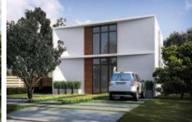
Casa Bianca -Carina $749,000

4 BR / 3 BA, 2,940 sq ft living area , 10 ft ceilings, luxury finish on this modernistic all concrete-and-glass masterpiece. Pre-construction single family.