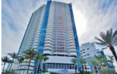
6301 Collins Ave #1605 $775,000

Beautifully remodeled Bayside home w/ pool & separate guest cottage. This home has rich wood floors & updated white shaker kitchen.