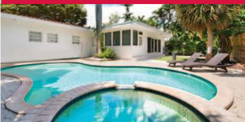
1361 98th St., Bay Harbor Islands | $1,395,000