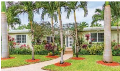
PENDING Miami Shores $639,000