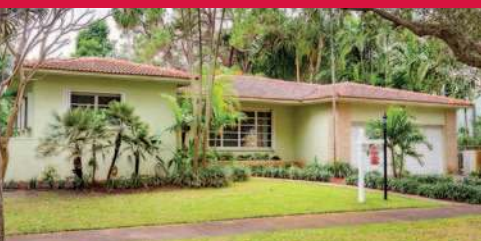
250 NE 91st St., Miami Shores | $699,000