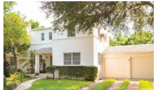
PENDING Miami Shores $760,000