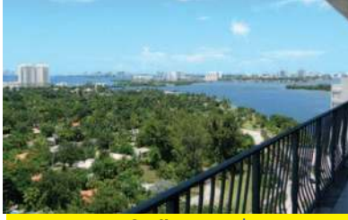
780 NE 69 St #1606 $199,000

Dripping in charm! This large 2,020 sf pre-war Belle Meade home has 3 BR / 2 BA, a separate 1 car garage. Sits on a large 7,629 sf corner lot.