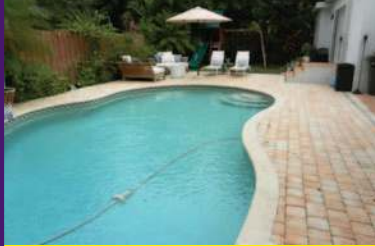
865 NE 71 St $749,000

One of the most beautiful Surfside homes ever! Totally remodeled, this MIMO ranch has 3 BR / 2 BA + garage. Open gourmet kitchen w/ granite counter + S.S. appliances.