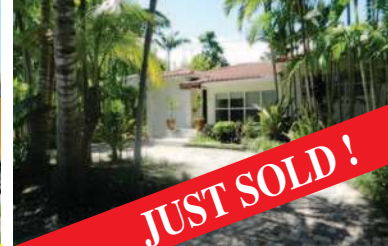
877 NE 73 St $760,000

One of the largest homes in Surfside, this 2,043 sf home has 3 BR / 2.5 BA plus an attached garage. Large rooms, formal dining room and spacious kitchen.