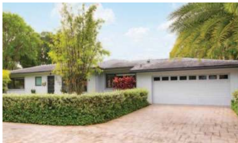
PENDING Miami Shores $879,000