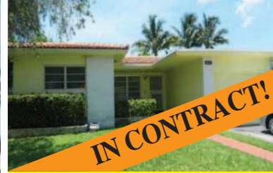
8810 Abbott Ave $775,000

Floor-to-ceiling glass allows you to enjoy beautiful 270 degree panoramic views from this SW 2 BR / 2 BA corner unit.