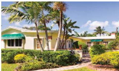
PENDING El Portal $399,999