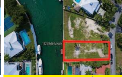
1125 Belle Meade Island Dr $1,750,000

Best value in Palm Bay! Breathtaking views of the bay and beaches from this 1BR/1.5BA condo in the popular Palm Bay Yacht Club.