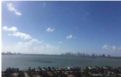
7901 Hispaniola Ave #1702 $579,000

Gorgeous, totally remodeled 2 BR / 2 BA plus den and resort style pool. This gem has 2 master suites, large closets & large new master bathrooms.