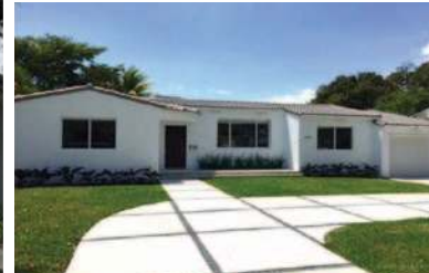
420 NE 52 Ter $1,195,000

Large 850 sf loft with great views and 14 ft ceilings in The Bank Condo. Zoned to work and live. Rare open kitchen, full bath & more.