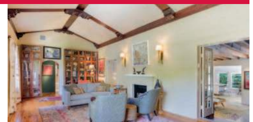
736 NE 94th St., Miami Shores | $685,000