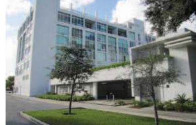
8101 Biscayne Blvd #R601 $275,000

Amazing corner unit with 270° panoramic views in the Lexi's best & most desired "02" line. Huge & deep wrap-around balcony, 10 ft ceilings and more.