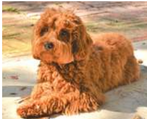
The Anne, Nestor & Remi Morales family of Miami Shores sent in this photo of their 11-month-old baby boy Blue.